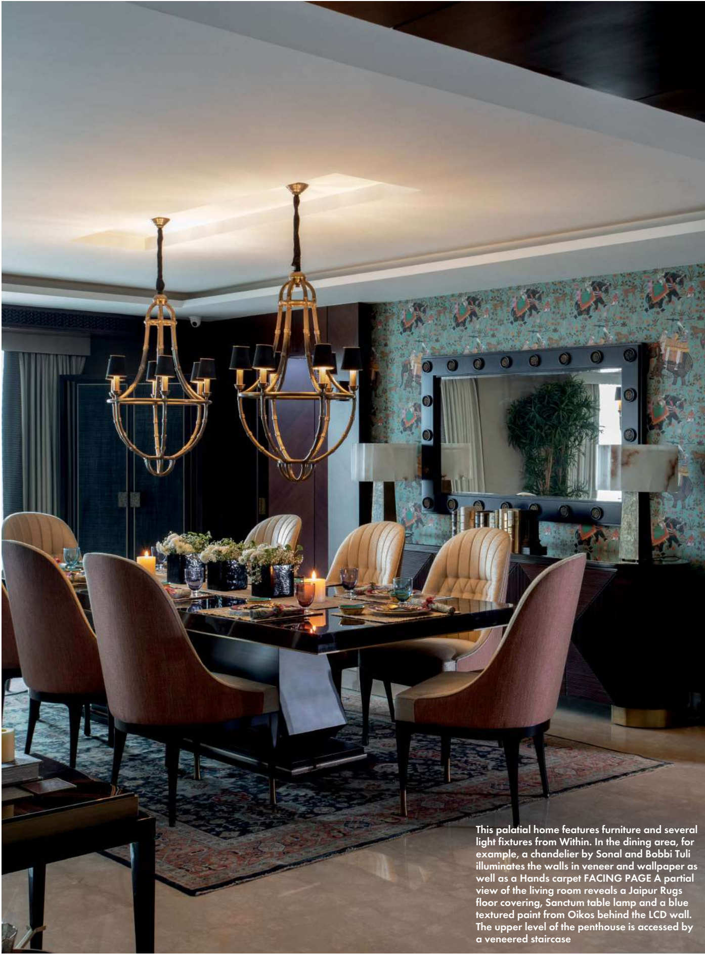
This palatial home features furniture and several light fixtures from Within. In the dining area, for example, a chandelier by Sonal and Bobbi Tuli illuminates the walls in veneer and wallpaper as well as a Hands carpet FACING PAGE A partial view of the living room reveals a Jaipur Rugs floor covering, Sanctum table lamp and a blue textured paint from Oikos behind the LCD wall. The upper level of the penthouse is accessed by a veneered staircase

TEXT BY SONAL AND BOBBI TULI PHOTOGRAPHY BY TANUJ AHUJA PRODUCED BY SONIA DUTT