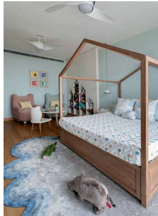
FROM LEFT In the guest room, floral blooms are complemented by a carpet from Hands and Trinity side table, which features an inlay using four different stones; A plush Hands rug is used in the daughter's bedroom

This 5,800 sq ft penthouse is abundant in opulence, cheer and warmth. At the same time, it speaks our practice's signature language of luxury with cordiality. Bobbi and I have filled it with layers of curiosity, peppered with memories and a mishmash of Indian and international influences.