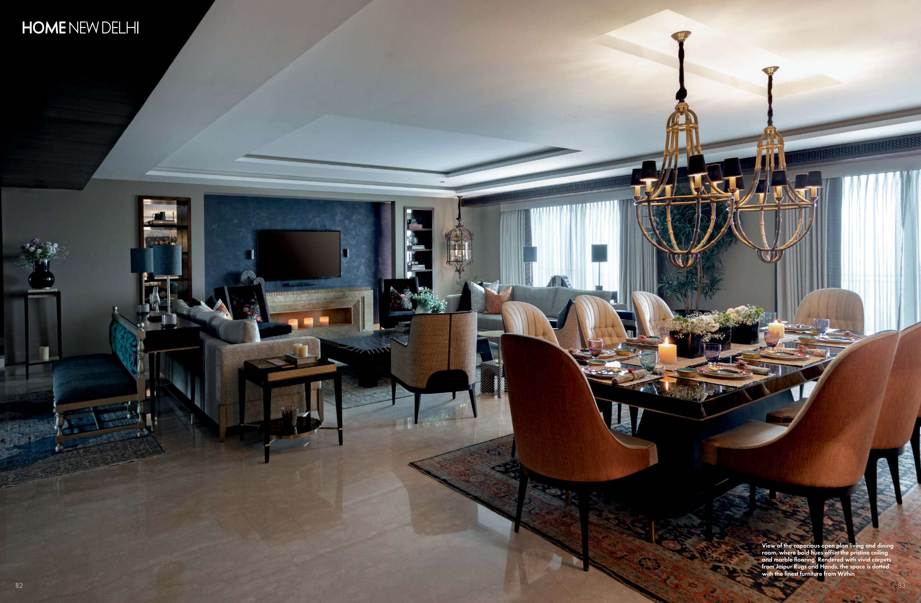
View of the capacious open plan living and dining room, where bold hues offset the pristine ceiling and marble flooring. Rendered with vivid carpets from Jaipur Rugs and Hands, the space is dotted with the finest furniture from Within