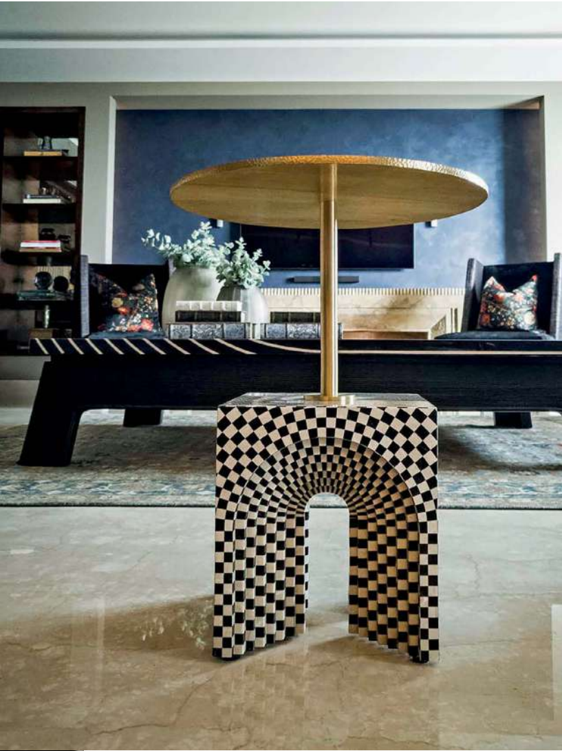
CLOCKWISE, FROM TOP LEFT Folding tables with identical sculptures stand in the entrance passageway; Sanctum, in the foreground, is an intricate, inlaid side table that juxtaposes two different stones; The Braid wicker chair (Bobbi's favourite) is paired with the Crest coffee table with an inlaid top in Italian stones FACING PAGE A vintage hanging lamp is placed near a niche made of veneer and antique mirror in this living room nook