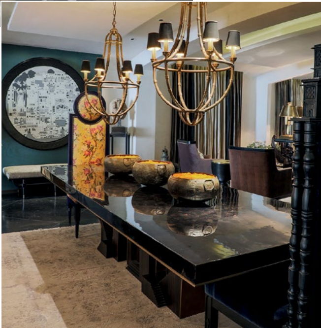
▶ The store's repertoire is built by Sonal and Bobby Tuli's commitment to good design, aesthetic sensibility, unparalleled quality and craftsmanship