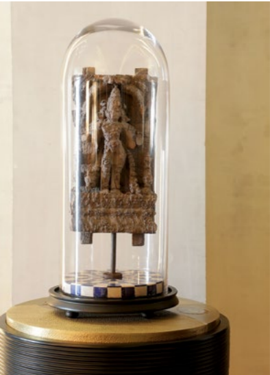
▶ Within offers exotic and antique home accents. Pictured here is one of Sonal Tuli's personal favourites