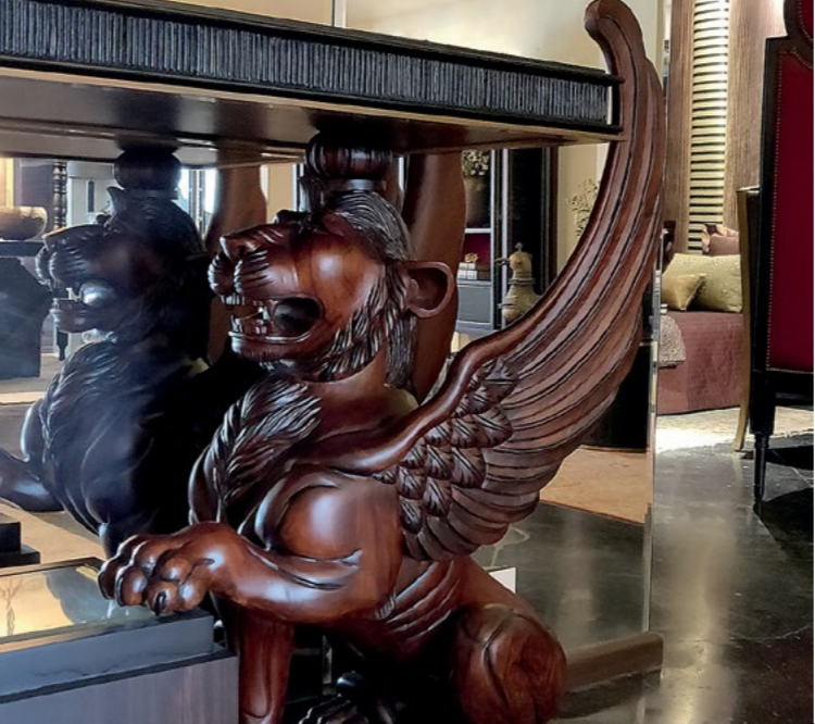
▶ The Guardian Console features a winged lion carved in solid wood

PHOTOGRAPHY BY TANUJ AHUJA PRODUCED BY SONIA DUTT